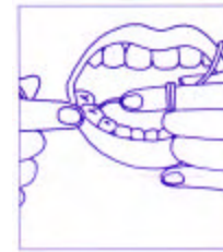
Using floss between lower teeth.