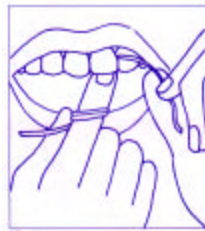
Using floss between upper teeth.